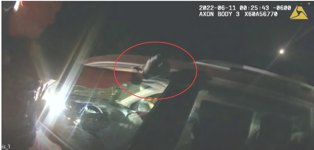
Ois 1 - 00:25:54 - 00:25:57