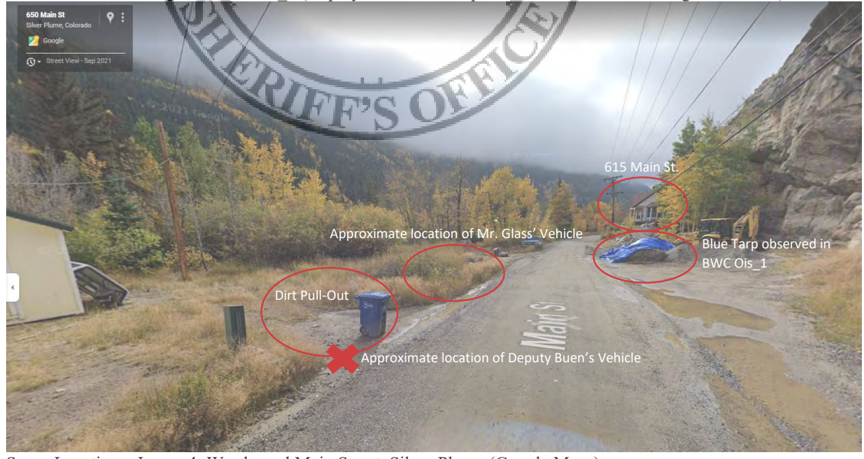
Scene Location – Image 4: Westbound Main Street, Silver Plume

Scene Location – Image 3: BWC Ois_1 (Deputy Buen's view upon arrival at the scene facing Westbound)