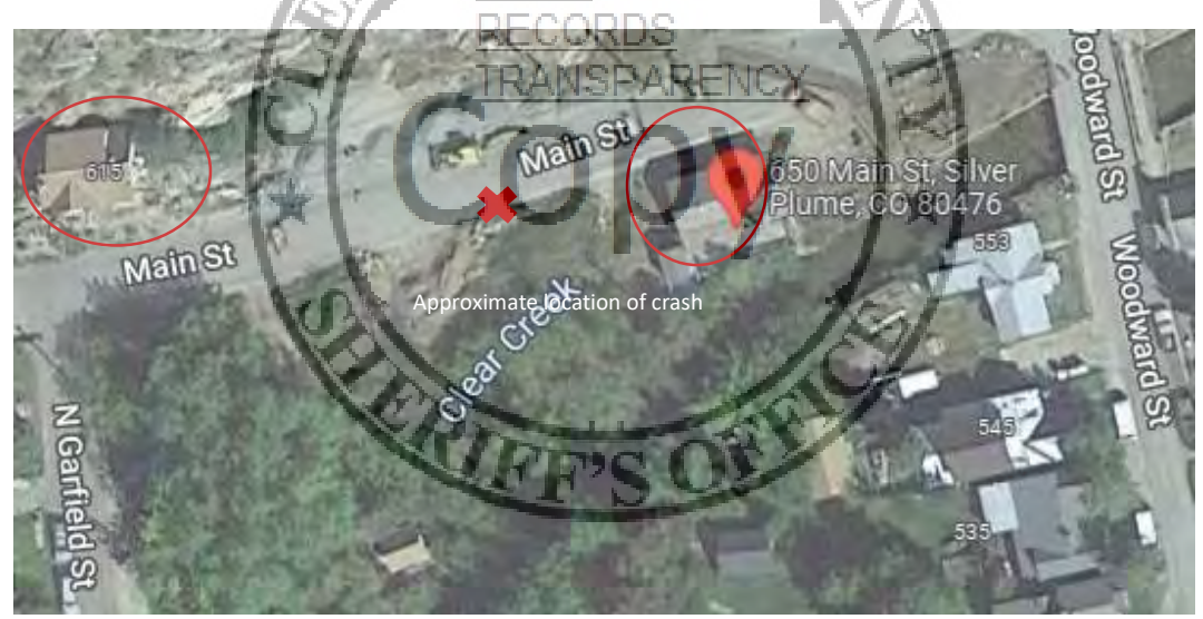
Scene Location – Image 1: Aerial view of Scene (Google Maps)

CSP, rather than CCCSO, investigates all crashes in unincorporated Clear Creek County.