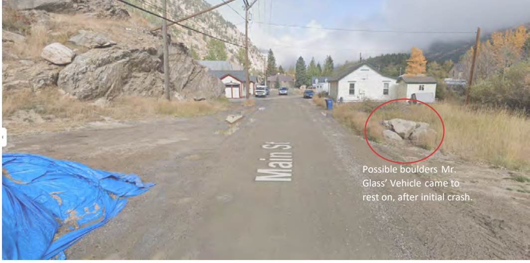
Scene Location – Image 2: Eastbound Main Street, Silver Plume